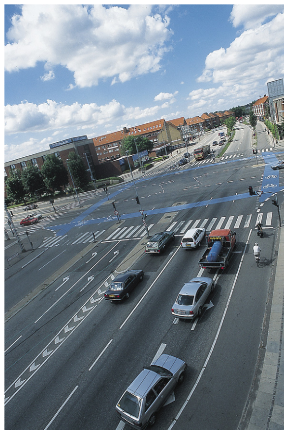
Fig. 1. Photo of signalised junction in Copenhagen with four blue cycle crossings.

The safety effects of blue cycle crossings are therefore studied using a “second-best” observational study methodology. The Empirical Bayes method (see e.g. Hauer, 1997) is viewed by many as the best of the non-experimental observational methods. The Empirical Bayes method accounts for three major possible