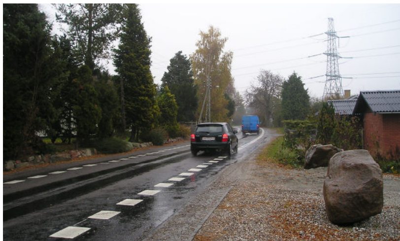
Figure 5: In meeting situations drivers give way to on-coming cars by crossing the intermittent edge line a little bit as intended.