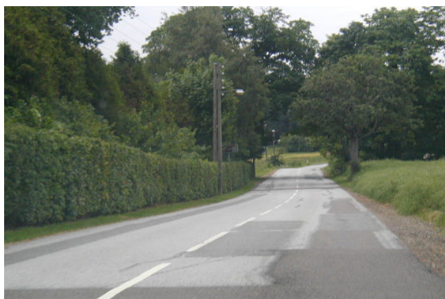
Figure 1: Before situation. Two lane rural road with centre line marking

The paved road width varies between 5.0 m – 6.5 m. The side areas are covered by grass or gravel. The road is a bit curvy. The annually daily traffic was about 2500 vehicles with 8-10 % trucks/busses.