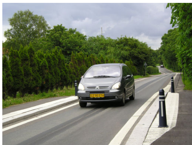
Figure 4: Speed reducer

The new "2-1"- profile is supplemented by 12 speed reducers - designed as 16 m long narrowings edged by side islands (see Figure 4).