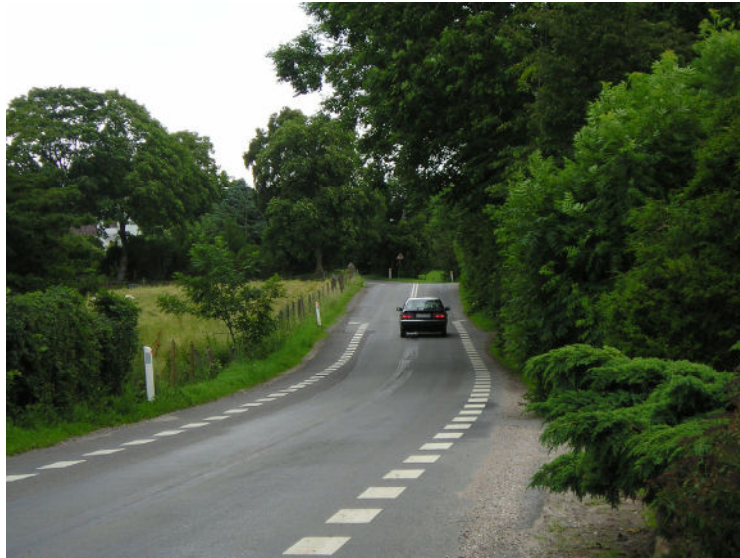
Figure3: Centre line marking is remained in curves when "stop sight distance" is too short.