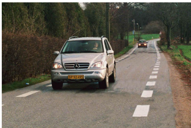
Figure 2: After situation. One central driving lane

In the new “2-1”- profile the centre line marking has been deleted. The redesigned road have only one central driving lane – 3.5m width – marked by 0.30m wide intermittent edge lines leaving an area of 0,85m width in both sides for cyclists and for cars to use in meeting situations (Figure 2)